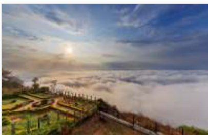
Nandi Hills 📍 61 Km