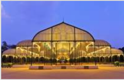
Lalbagh Botanical Garden

Bengaluru- a place where various cultures crosses paths and splendid past mingles with modern pleasures, is fondly known as 'The Garden City of India'. This joyful city has earned quite a few names such as 'Silicon Valley of India', 'Air Conditioned City', 'Pub Capital of India', and 'Pensioners' Paradise' all for its lush green landscapes, healthy climate, and modern conveniences. Often termed as 'techie's paradise', Bengaluru has plenty of things that are of great tourist interest like gardens, natural landscapes, palaces, temples, and museums. All these things together represent a wonderful blend of past and present, and this is the reason a lot of people admire the city for its culture, natural beauty & vibrant.