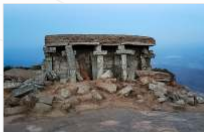
Skandagiri 📍 62 Km