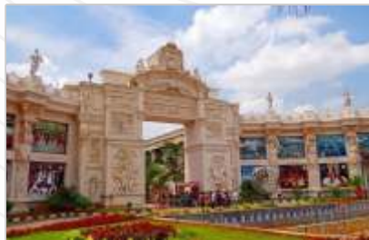
Innovative Film City