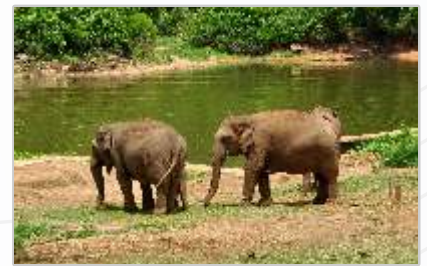
Bannerghatta National Park