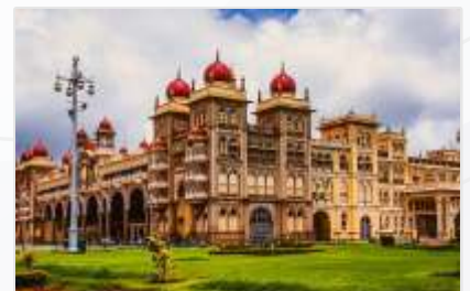
Mysore 📍 140 Km