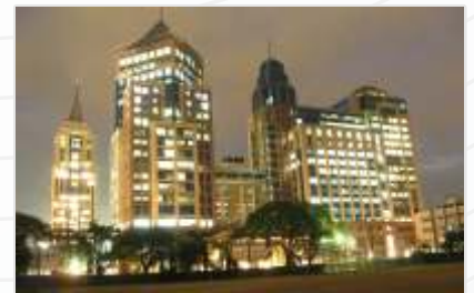
UB City Mall