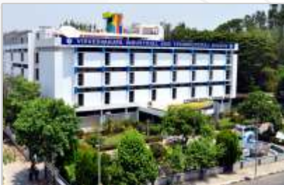
Visvesvaraya Industrial and Technological Museum